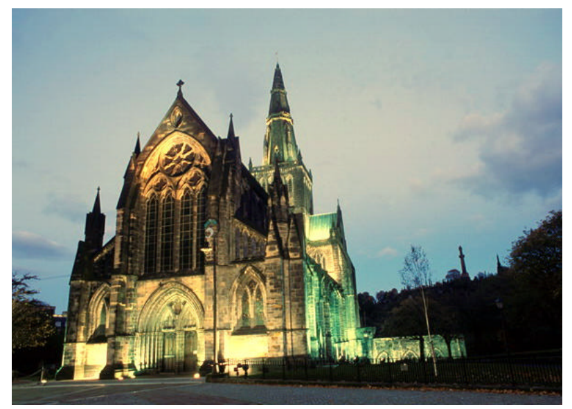
The Cathedral of Glascow at Night